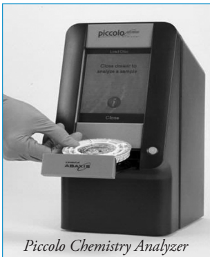
Piccolo Chemistry Analyzer

Meanwhile, LE notes that Theranos’ miniLab looks a lot like a smaller desktop analyzer made by Abaxis Inc. (Union City, CA). Abaxis introduced its Piccolo chemistry analyzer to the lab marketplace in November 1995. The FDA-cleared Piccolo is about the size of a shoebox, weighs only 12 pounds, and offers the largest test menu (31 routine chemistry tests) of any POCT system on